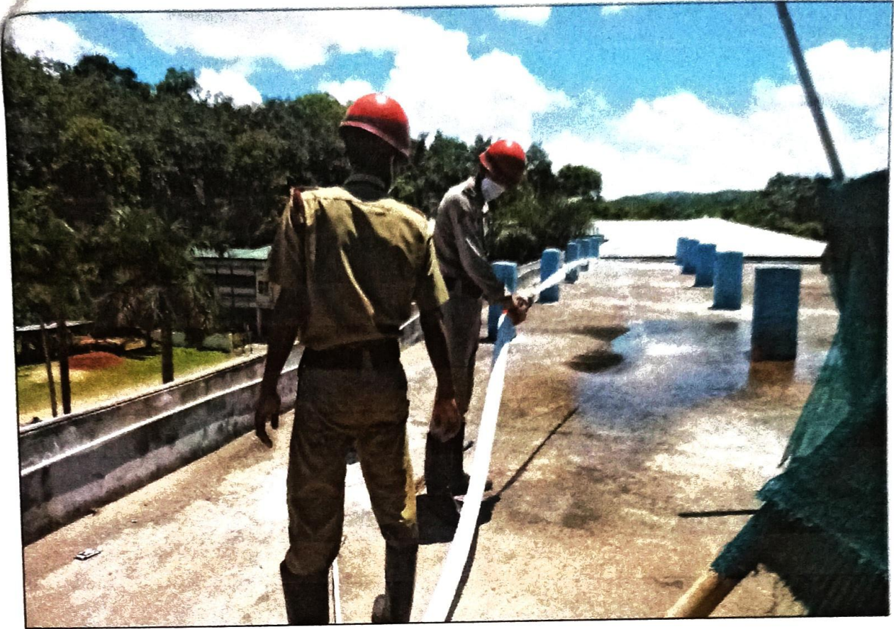
Mock Drill for the Students: